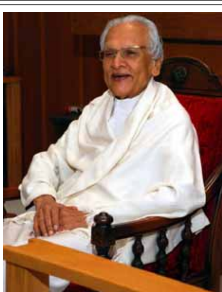
Gurudev Shree Chitrabhanuji

My friend you are not the figure, caste, creed, woman or man. You are the light . When you feel the light in you, you feel it in others. When you feel the light, you will not hurt others. You will help. Light will not hurt light. Light will help light. If there are two or three lights, and you bring in another outside light, light will merge with the other light. Light is not separate; inside and outside is in